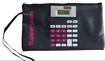
Calculator Money Bag