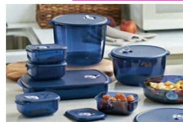
8-Pc. Vent N Serve® Set

Congratulations! Register now for Jubilee @ exclusive rate. Just register one new Consultant to qualify. See reverse for details.