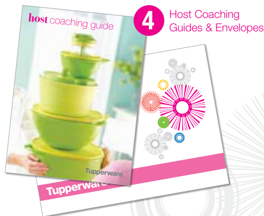
4 Host Coaching Guides & Envelopes